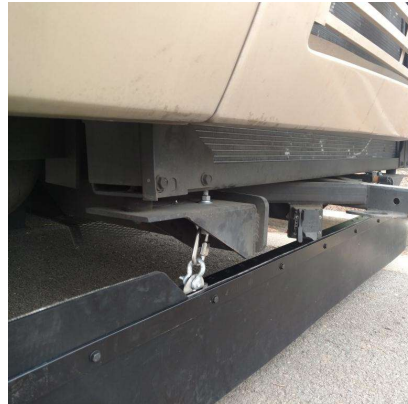
Monaco hanging point