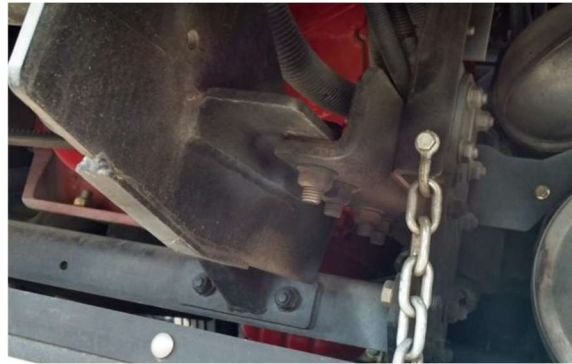
Allegros hanging point