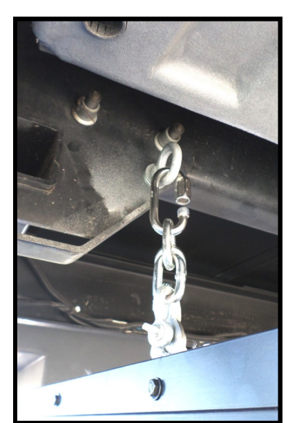
Quick link with collar screwing downward.

Standard hardware configuration. Chain may be lengthened or shortened to desired length.