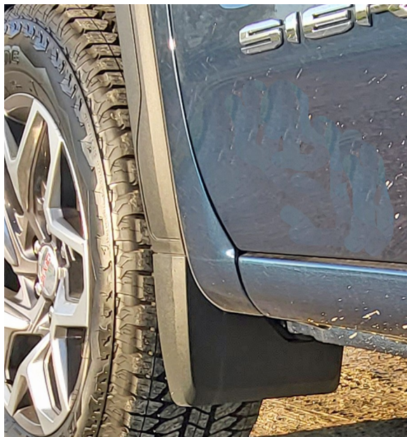
Narrow front Splashguard