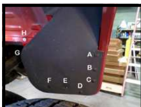
FR20 17, FR20L 17

IF YOU HAVE ANY QUESTIONS OR CONCERNS PLEASE GIVE US A CALL AT 541-245-9148