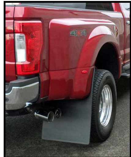
FR20 17, FR20L 17