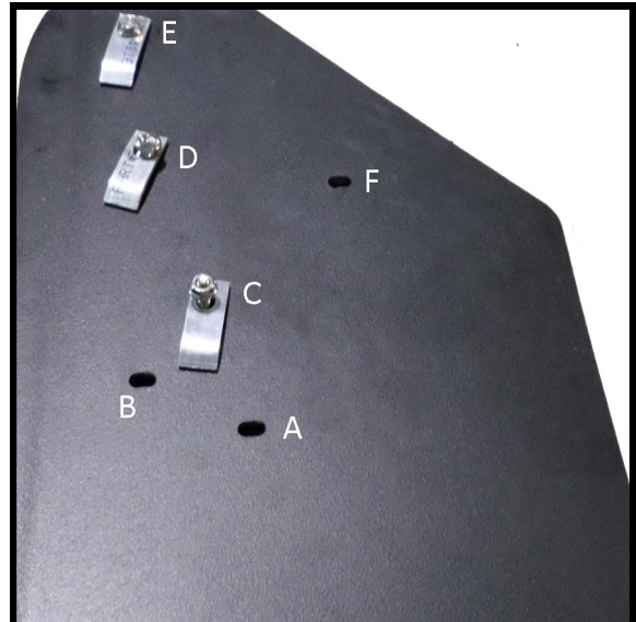
FR12 15 150 NF, FR12L 15 150 NF, FR14 15 150 NF, FR14L 15 150 NF 6- flat clips #10001; 2- Aluminum F-150 15 Z brackets #10020