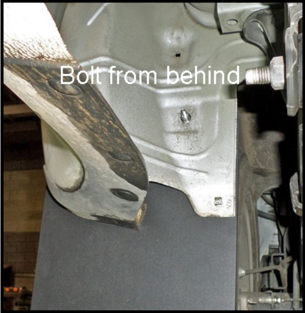
Bolt from behind