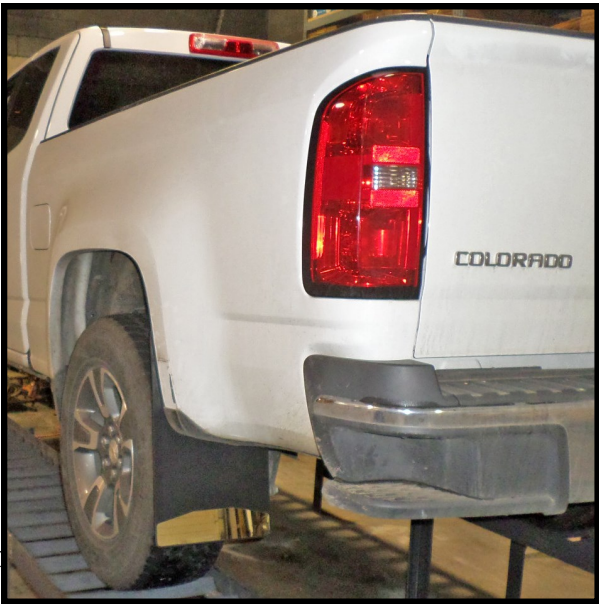
Flat clips #10001