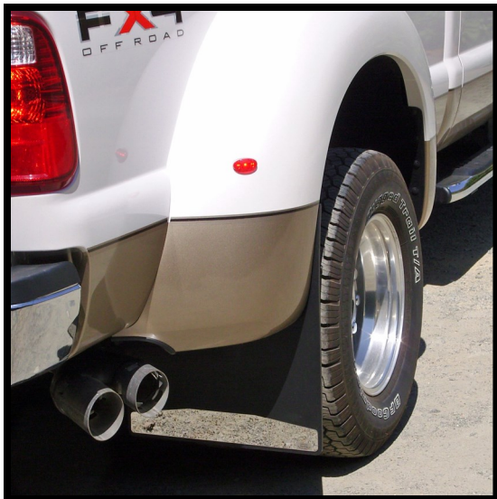
FR20 11, FR20L 11