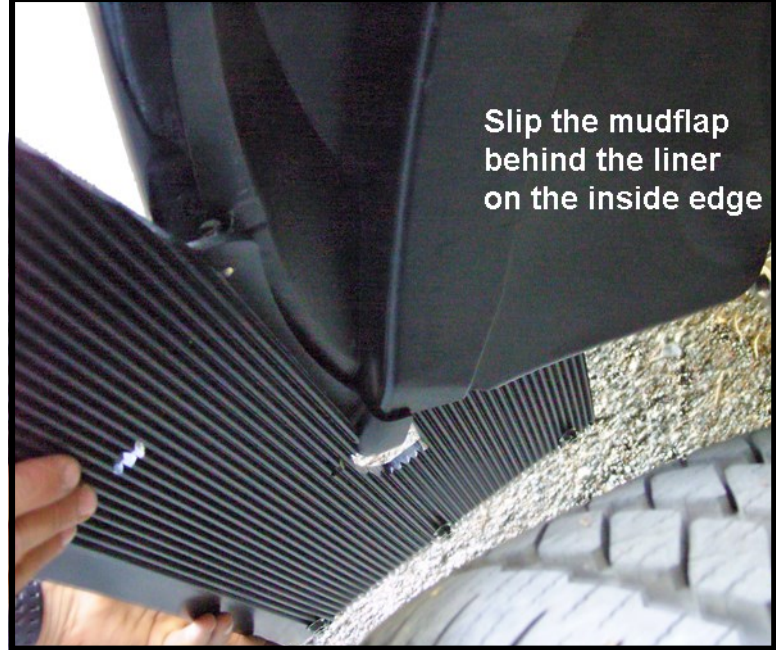
If you have aftermarket flares, and do not have the cap covering the pinch weld at the bottom outside edge of your fender well, let us know. We will send you the mud flaps without the deep cut out that goes around that cap.