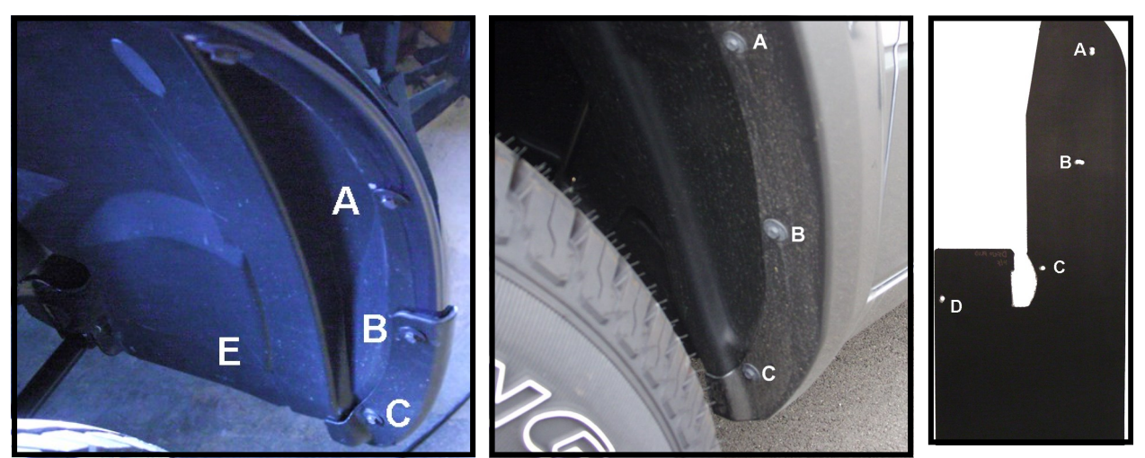
Pre-install without flares

IF YOU HAVE ANY QUESTIONS OR CONCERNS PLEASE GIVE US A CALL AT (541) 245-9148