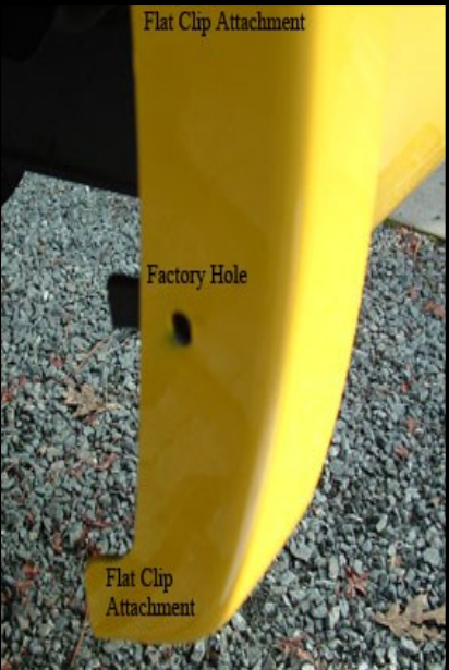
FR12, FR14, FR12 08 NF, Twist Brackets