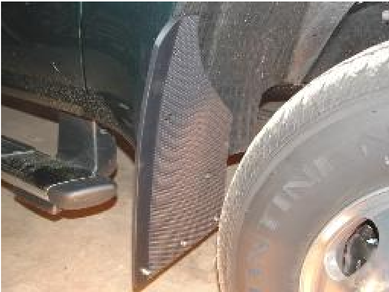
FF12 08, FF12L 08, FF14 08, FF14L 08